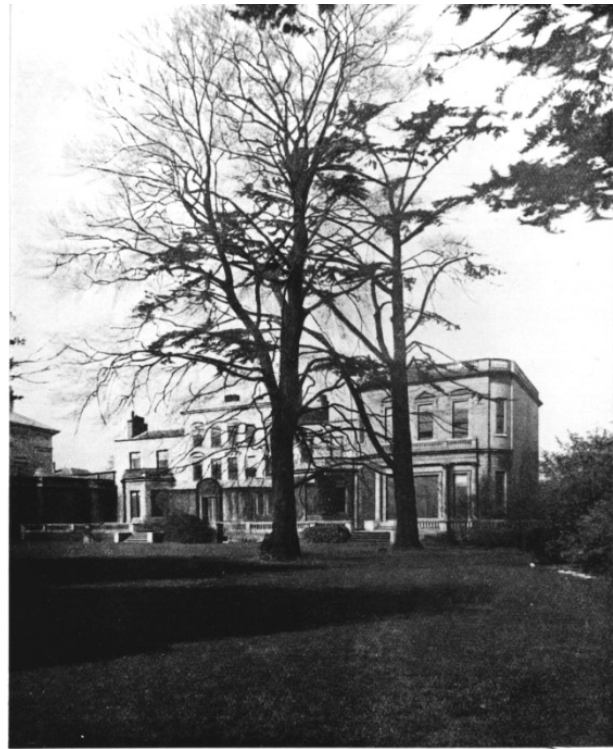
Figure 3. Cavendish's house on Clapham Common, now demolished. The house, with some later additions, is shown here from the back. Legend has it that Cavendish's experiment was performed in an outbuilding.

One thing that is striking about the Schehallien expedition is that, although Cavendish suggested the method, took a leading role in its planning, supervised the repair of the field instruments, checked all the field data and contributed to its analysis, he remained throughout at home in London. He kept a very low profile and his contribution was noticeable only to those intimately involved. Not for him the camaraderie of a field expedition, or the wild party